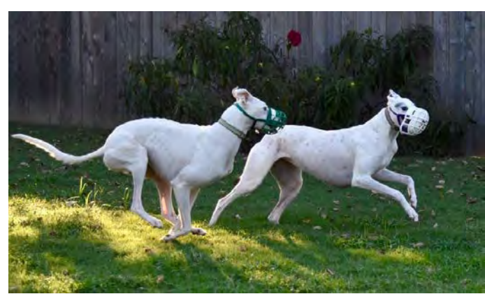
Muzzles for safety during Gizmo and Bandita's playtime.

Play times should be mornings and late afternoon. Hounds can overheat quickly even in pleasant weather so monitor them closely.