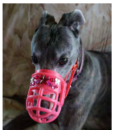
Muzzles for safety AND as an elegant fashion statement

I know it may be hard for some of you to envision your dozy, elegant, demure, needle-nosed sofa ornament, as a fierce and fiery hunter, capable of committing mortal acts at the mere pitch of a sound.