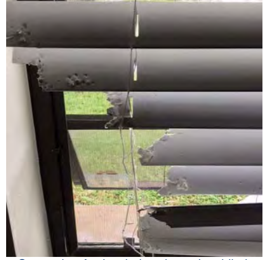
Separation Anxiety led to chewed up blinds

So, is it any wonder that a newly adopted greyhound, suddenly thrust into what for them is an alien universe, full of strange things and unfamiliar people---and perhaps without the company of other greyhounds, for the first time in his life---might feel some uneasiness?