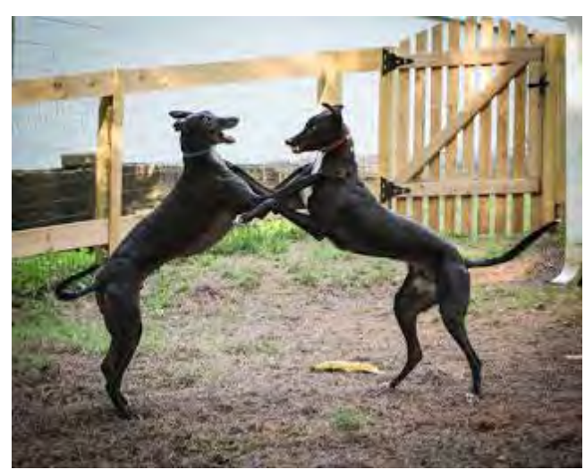
Greyhound play can lead to issues, think big teeth and thin skin.

It is not anything the Greyhound can control, or that you can train or wish away.