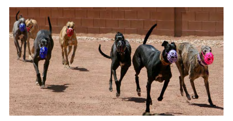
Safety FIRST! ALL HOUNDS IN THE PLAY AREA SHOULD BE MUZZLED! NO EXCEPTIONS!

Many dog owners do not follow leash laws. How many times have we seen someone with their off leash little dog thundering toward your "not cat/small dog safe" Greyhound while loudly stating that their little dog is friendly! That's nice, but my Greyhound will dispatch your little dog in a heartbeat if given the opportunity. While many Greyhounds are small dog/cat safe, why put your hound at risk.