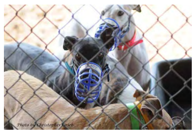
Bay Bay (Bay Invasion) in the turnout pen with her friends at the racing kennel.

Now, racing professionals insist that their greyhounds be muzzled at all times during turnout sessions, when there can be as many as 25-30 greyhounds in one turnout area. This, again, is for the Greyhounds' own protection.