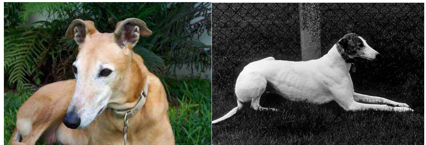
Our lap dog Jim