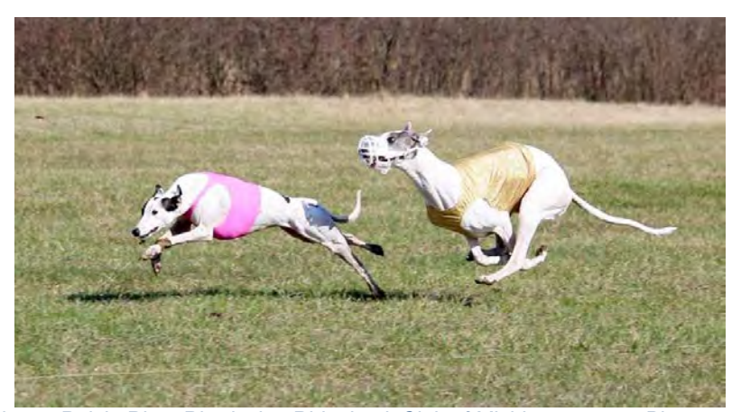
Greyhounds lure coursing at Raisin River Rhodesian Ridgeback Club of Michigan event

There was a time when most young Greyhounds were given the opportunity to course after live game (the pestilence of jackrabbits), prior to beginning their racing careers. The anti-racing activists of the 1970s and 80s, focused much of their energy and effort toward banning the practice of live game coursing by Greyhounds. Eventually, they succeeded, in some locales.